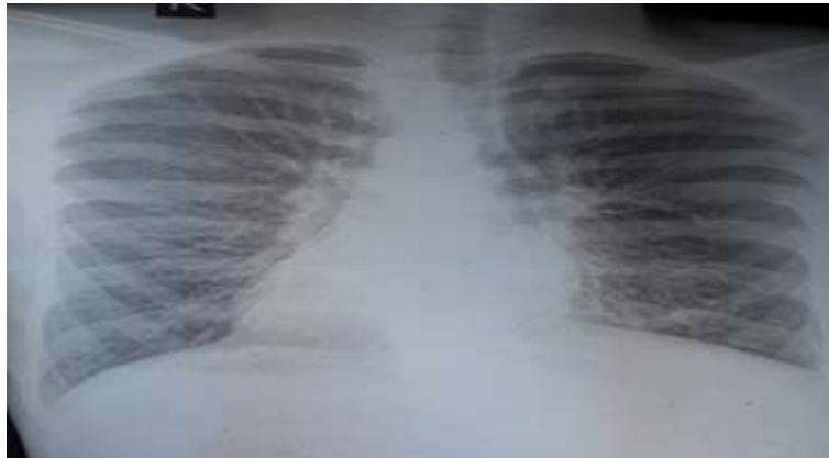
Figure 1 Chest X-ray showing dextrocardia with normal lung field